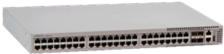
Arista 7010T-48: 48 port 10/100/1000 and 4 port 10GbE Switch

Consuming under 52W the 7010T are extremely power efficient at less than 1W per port. Built in power redundancy and customer reversible redundant fans allows cooling airflow in either forward or reverse direction in a single system.