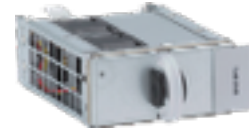
Arista 7010T hot swap and reversible fan module