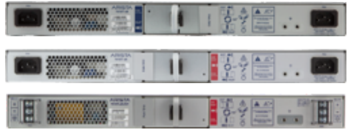
Arista 7010T Rear View - reversible airflow, AC & DC