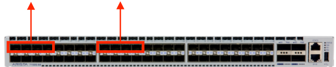
Arista 7150S AgilePorts - Four SFP+ grouped to deliver 40GbE