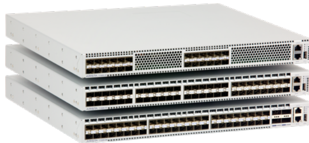
Arista 7150S family

Designed to suit the requirements of demanding environments such as ultra low latency financial ECNs, HPC clusters and cloud data centers, the class-leading deterministic latency from 350ns is coupled with a set of advanced tools for monitoring and controlling mission critical environments.