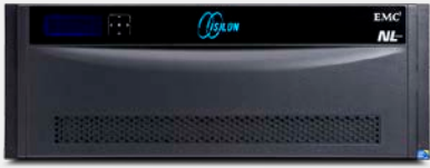
EMC Isilon NL400