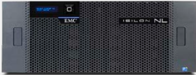
EMC Isilon NL410

The challenge of cost-effectively storing and managing data is an ever-growing concern. You have to weigh the cost of storing certain aging data sets against the need for quick access. Meeting this challenge requires a solution that bridges the gap between high-performance (but costly) primary storage and inexpensive (but management-intensive) offline storage solutions.