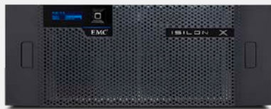
EMC Isilon X410

The EMC® Isilon® X-Series, powered by the OneFS® operating system, uses a highly versatile yet simple scale-out storage architecture to speed access to massive amounts of data, while dramatically reducing cost and complexity. The Isilon X-Series is comprised of three product lines — the Isilon X200 and X210, 2U platforms, and the Isilon X410, a 4U platform. The Isilon X-Series is highly flexible and strikes the balance between large capacity and high-performance storage. The X-Series is an ideal solution for high-throughput and high-concurrency applications. With SSD technology for file system metadata and file-based storage workflows, the EMC Isilon X-Series also accelerates namespace-intensive operations.